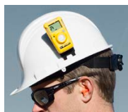
Hard Hat Clip