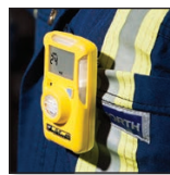
Easy To Wear